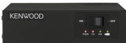
KVT-11 Image Encoder

The new products are in step with Kenwood's "green" ecological initiative of environmental responsibility in product design, production and procurement.